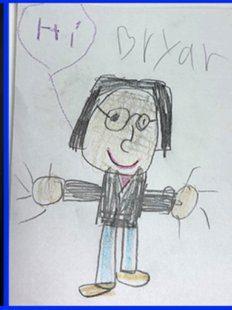
Drawings by: Bryar Schneider, 7 years old