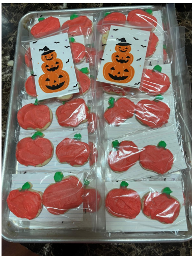
Homemade, festive treats.