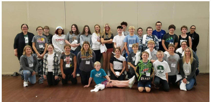
Trinity Youth @ LYO