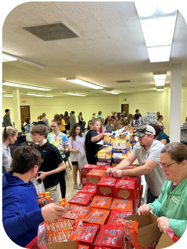
Filling bags for United Way Backpack Program