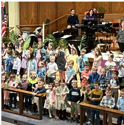
Church School sings for Palm Sunday