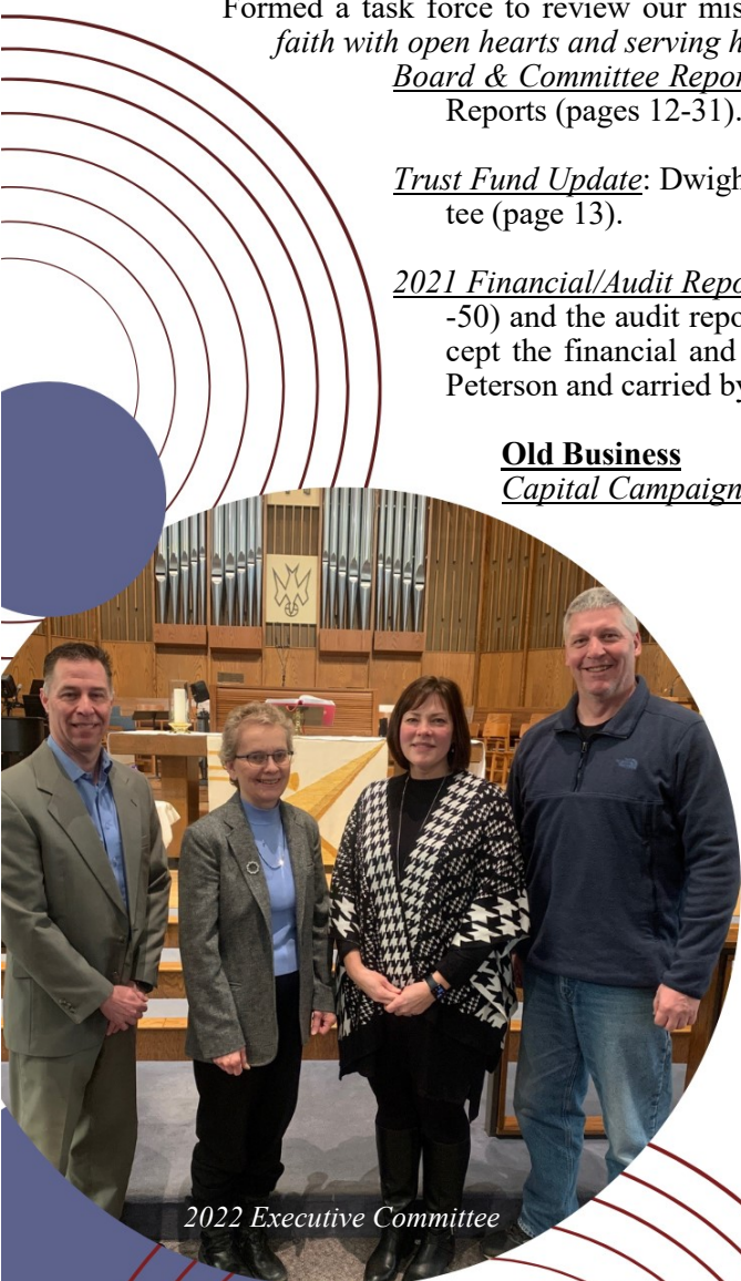
2022 Executive Committee