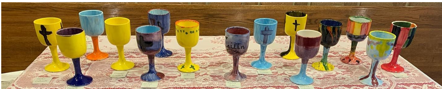
Confirmation chalices used for First Communion