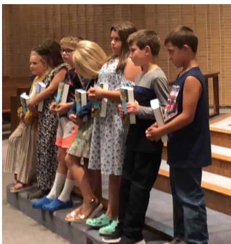
3rd Graders receive Bibles