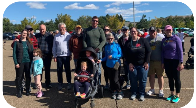
"Out of the Darkness" Walk

This past year as a congregation Trinity: