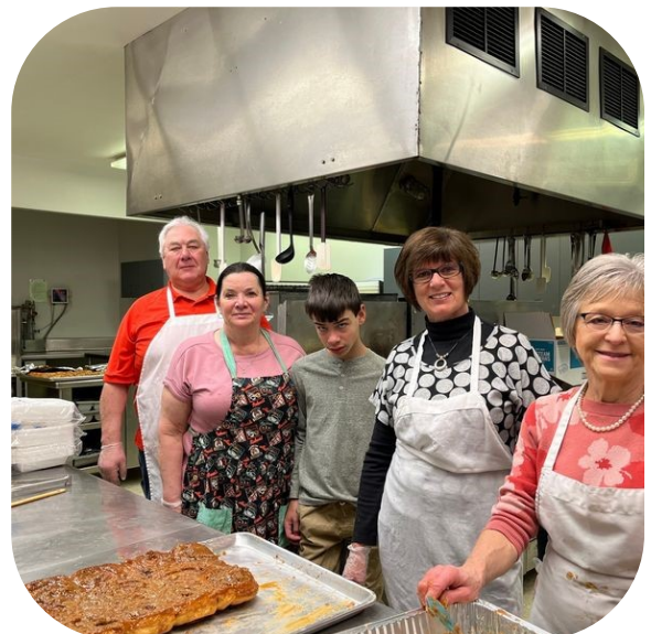
Palm Sunday Breakfast