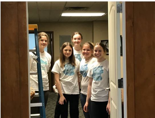
Confirmation Service Projects