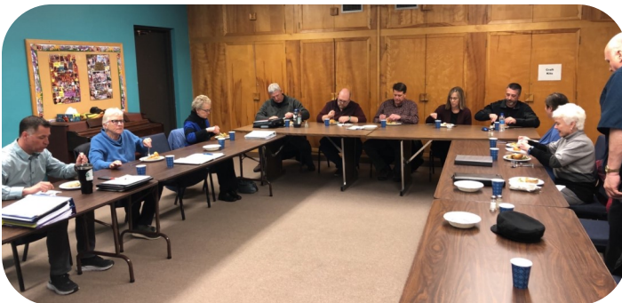
Appreciation Dinner for Council