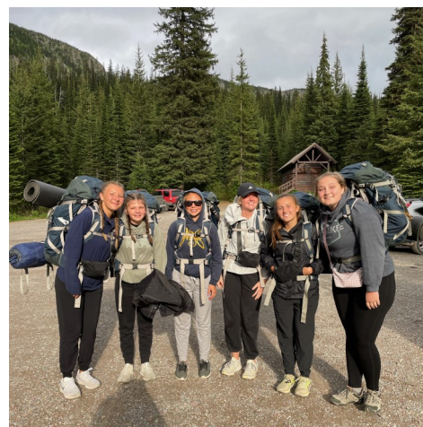
Flathead Mt. Youth Trip