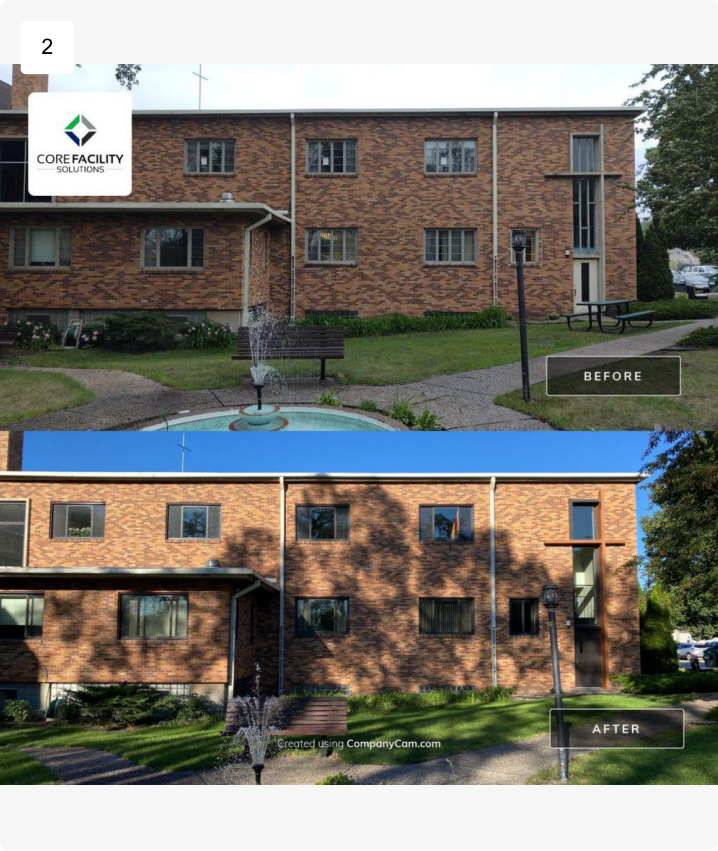
Project: Trinity Lutheran Date: 9/14/2021, 9:50am Creator: Kris Schwab Tags: Before and After