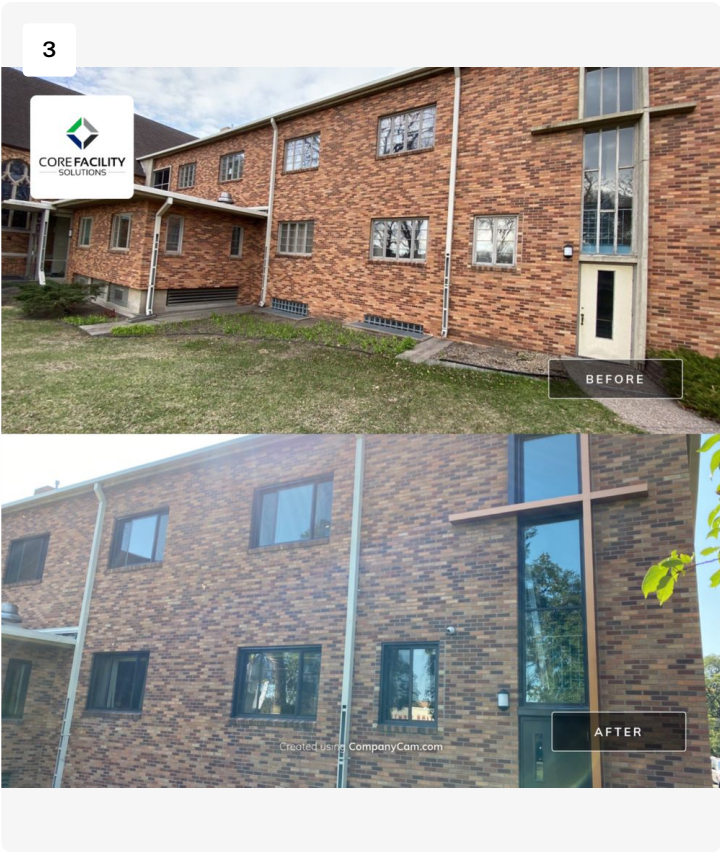
Before and after photos of work completed on the east side of the building.

Project: Trinity Lutheran Date: 9/9/2021, 3:48pm Tags: Before and After