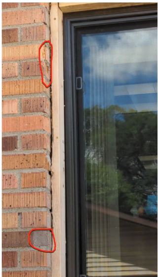
Previously damaged brick to be replaced