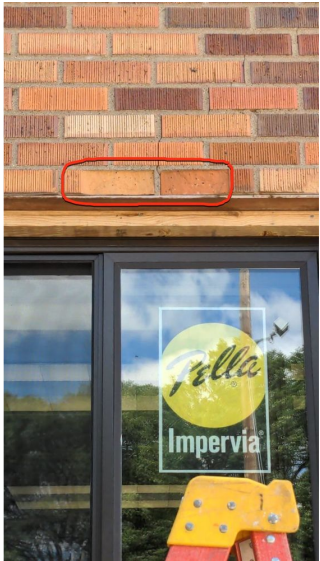
Previously damaged brick to be replaced