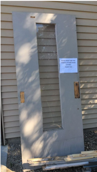
Retired door. Thank you for your service!