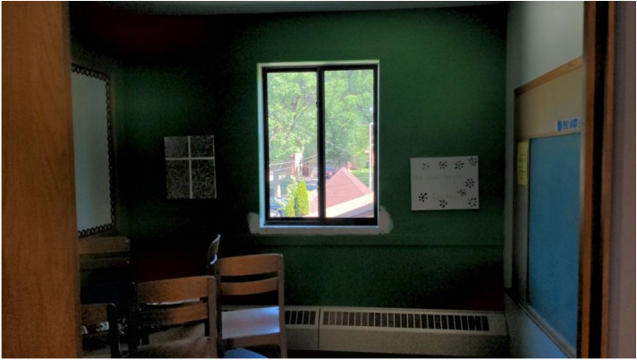
Interior Finish Underway