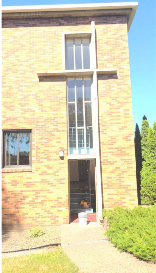
Opening preparations for new secure door to be installed