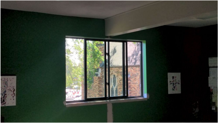
Interior Finish Underway