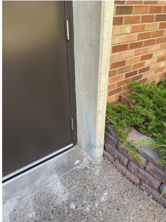
Concrete repair made at NE exterior door. This will eventually be sealed and covered in metal.