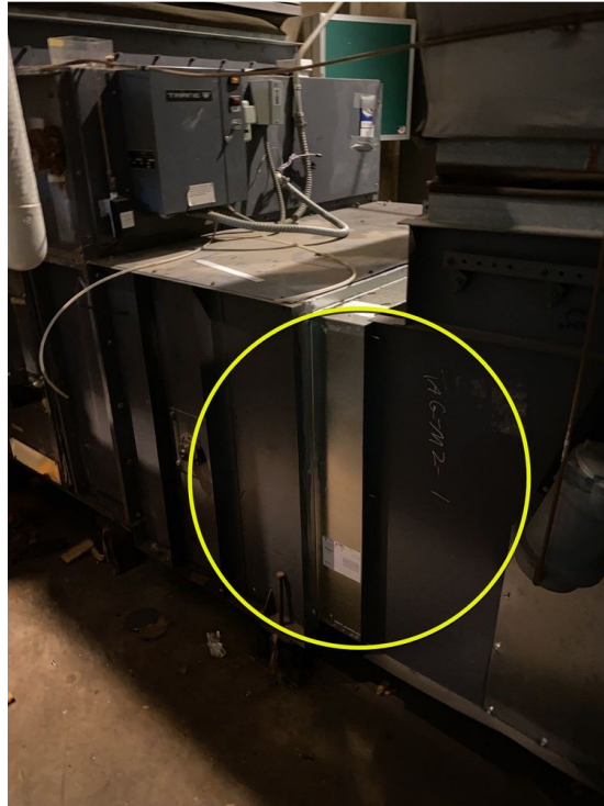
New cooling coil is installed.