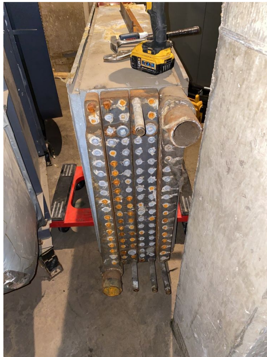
The old cooling coil that was removed was in very rough shape.

Project: Trinity Lutheran Date: July 21st, 2021, 9:55 a.m.